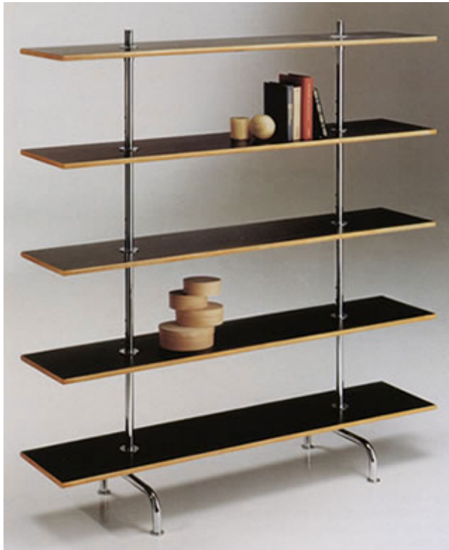
Exhibit BAUHAUS. Bookcase c1931 by Marcel Breuer, a student and teacher at the Bauhaus school.

One manifestation of cultural phenomena is the emergence of schools of design or design movements . Perhaps the most influential school of industrial design was the Bauhaus formed by Walter Gropius in Germany in 1919. The central tenet of the Bauhaus was that good design arises from the seamless integration of art and craft. Gropius articulated a set of design principles including “organically creating objects according to their own inherent laws, without any embellishment or romantic flourishes.” One of the most famous designers to emerge from the Bauhaus was Marcel Breuer whose bookcase from 1931 is shown in Exhibit BAUHAUS. Although the Bauhaus survived less than 15 years, the aesthetic style of functional minimalism is still today broadly influential.