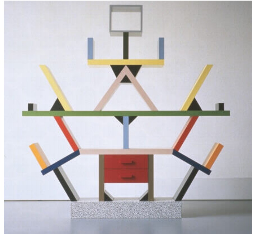
Exhibit MEMPHIS. The Carlton bookcase c1981 by Ettore Sottsass the founder of the Memphis group. ( http://boijmans.medialab.nl/onderw/genre/indvrmg/iv3b.htm )

The Memphis movement was formed in 1981 as a consortium of Italian designers led by Ettore Sottsass. The movement was essentially a reaction against modernism, which was to a large extent an outgrowth of the Bauhaus. The Memphis designers produced whimsical, colorful, and even illogical artifacts. An example of Sottsass's work within Memphis, another bookcase, is shown in Exhibit MEMPHIS.