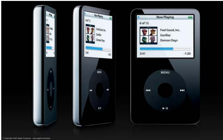
Exhibit GLOSS. We like glossy objects, perhaps because of hard-wired attraction to water.

Exhibit GLOSS is a consumer electronic device, the iPod portable music player created by product designers at Apple Computer. Most people find it very attractive. Many explanations are possible, but one element of its attraction is that it is glossy . How could the surface finish of an engineered component invoke a vestigial aesthetic response? Coss and coworkers have argued that our brains are hardwired to love reflective surfaces because the only reflective material on the savanna in the Pleistocene was water , and water was a scarce and highly valuable substance (Coss and Moore 1990). They further showed that infants will pick up and lick glossy objects more frequently than the same forms with matte surfaces. To me, it is highly plausible that humans possess cognitive mechanisms for detecting and rewarding the detection of glossy surfaces, and that these mechanisms are quite fundamental.