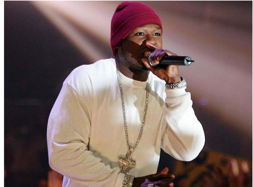
Exhibit 50CENT. The hip hop artist 50 Cent wearing his bling.

It is easy to imagine other symbolic relationships that could explain aesthetic responses. Most of these relationships operate on symbols whose values are themselves dynamic. A few relatively straightforward relationships could give rise to phenomena that appear complex and dynamic, such as fashion in current society. One such simple mechanism is explored as an economic model by Pesendorfer (1995). I suspect many others are possible.