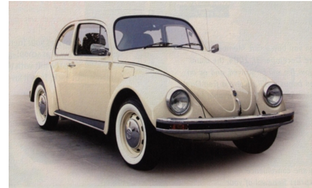
Exhibit VW. Why is this car cute?

Exhibit VW is a early Volkswagen Beetle automobile. Is there anyone who doesn't immediately find this car cute? How can a car be cute? Why do we like cute inanimate objects? We don't need much imagination to create a theory of cuteness. Babies exhibit certain physical features such as forward facing eyes and rounded heads and these features are attractive to adults who can provide resources and protection for the young. The cute phenomenon could have plausibly evolved to provide reproductive advantage to humans. So powerful are cute features in invoking attraction, that our cognitive mechanisms are tricked into oohing and ahing over collections of sheet metal that resemble babies.