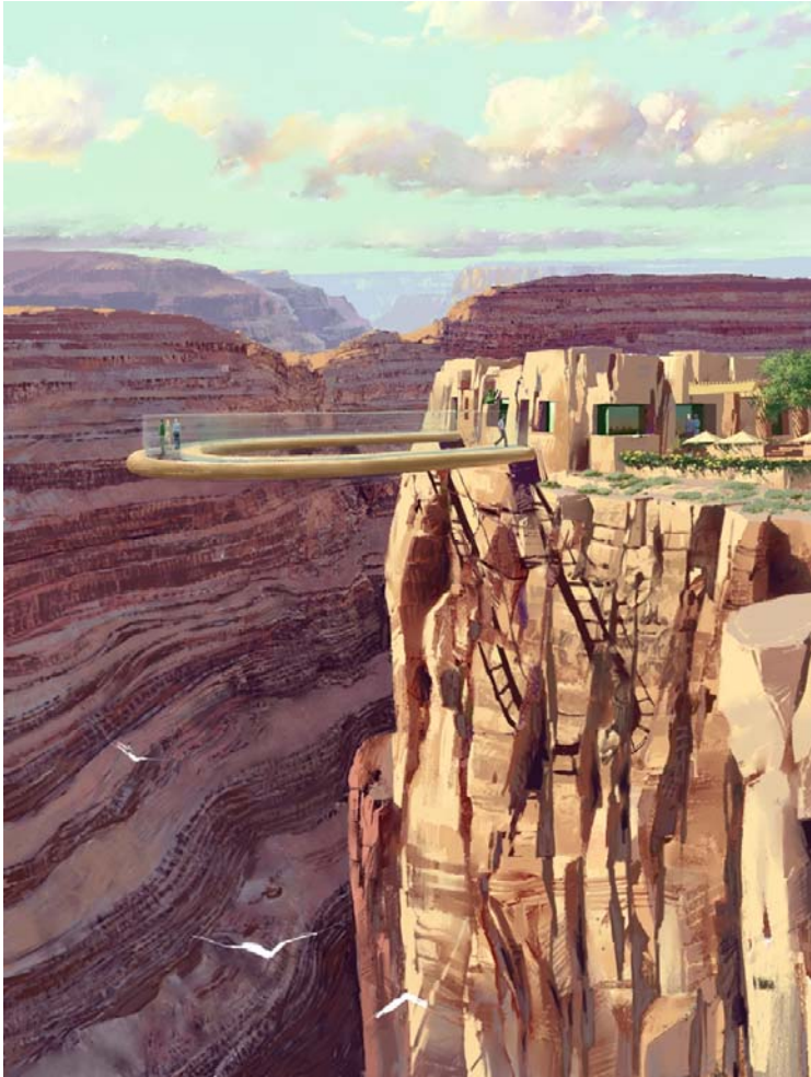
Exhibit GRANDCANYON. Proposed cantilevered walkway over Grand Canyon. What is your aesthetic response? What is your mental physics processor telling you?